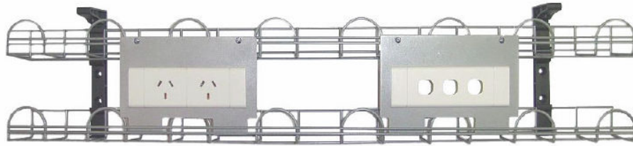
Two tier shown with mounting plates