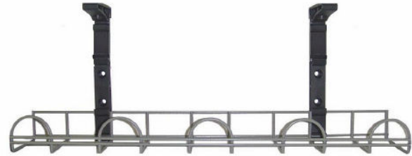
Single tier with mounting brackets

CMS have now released a new flexible of cable management basket with two new vertical mounting brackets, which allows the installer to switch between a two tier basket to a single tier basket.