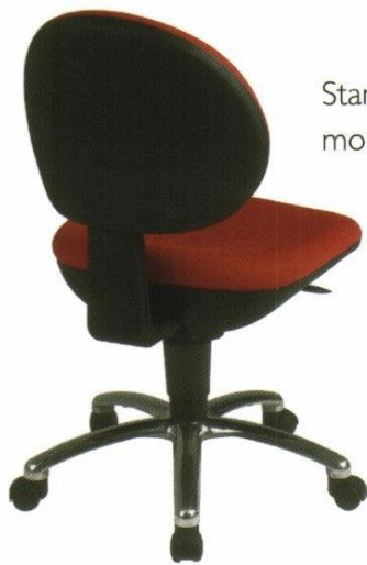
Standard moulded back