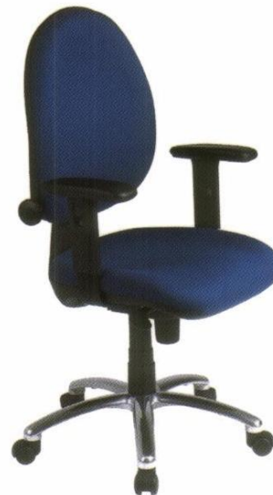
High back with height adjustable arms, and adjustable backrest lumbar support