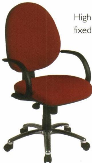
High back with fixed 'arc' arms