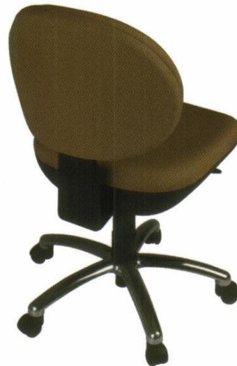
Optional full upholstered back