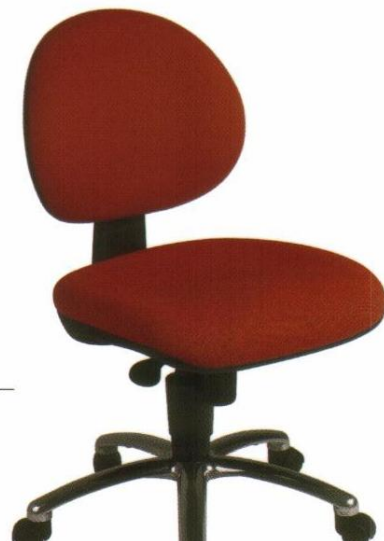
Medium Back – No Arms

The Guardian Task Chair range reflects quality in workmanship and design. Features include: